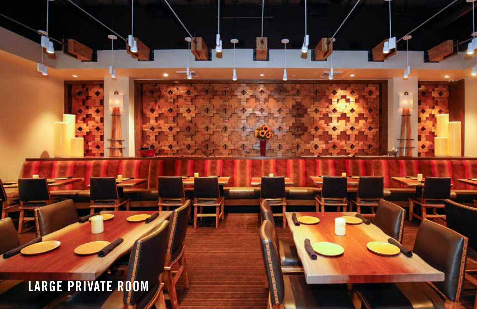
LARGE PRIVATE ROOM