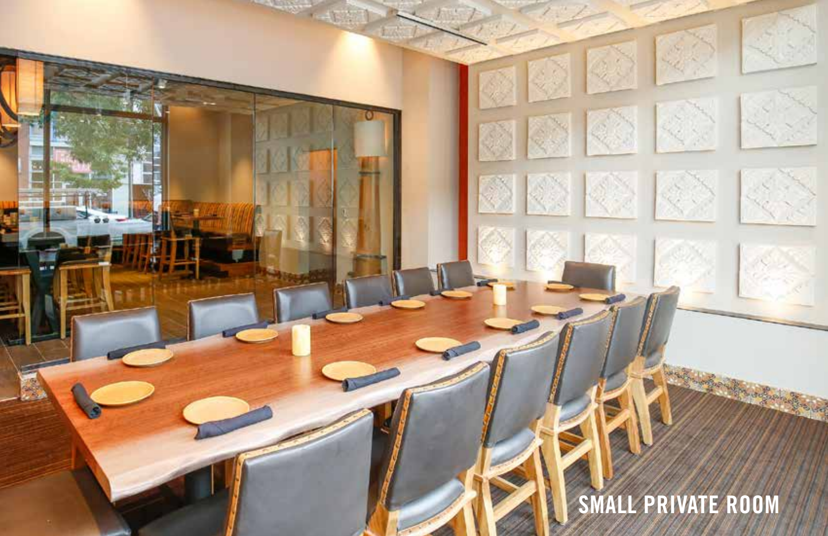
SMALL PRIVATE ROOM