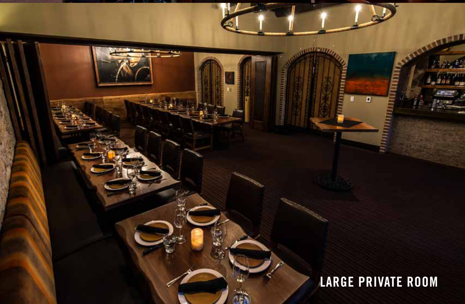
LARGE PRIVATE ROOM