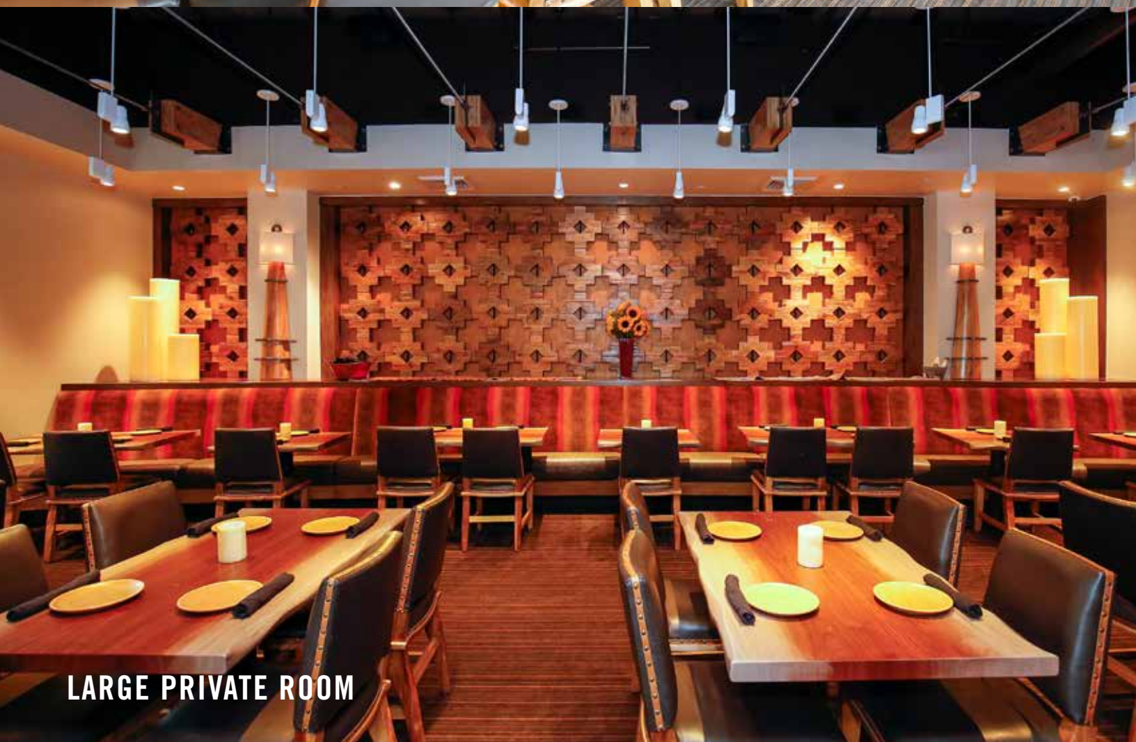
LARGE PRIVATE ROOM